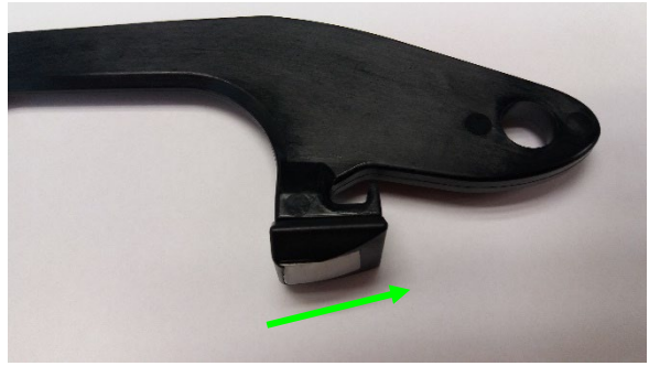
Wear Pad slopes towards back of the arm