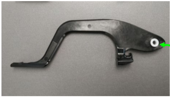
Ensure Arm Spacer bushing is installed