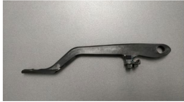
1 X Lower Arm (Part No 1510-012)