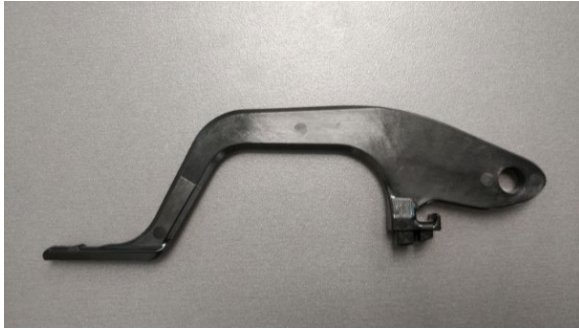
3 X Upper Arm (Part No 1510-011)