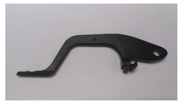
Upper Arm ( Part No 1510-012 )