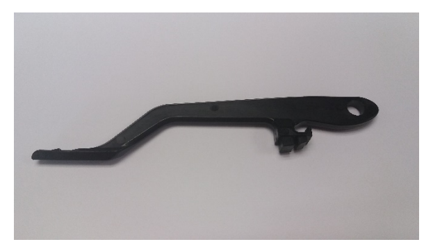
Lower Arm ( Part No 1510-011 )