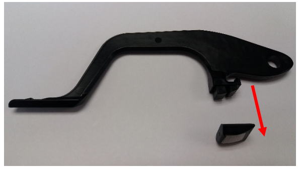
Remove wear pad by pulling down away from the arm